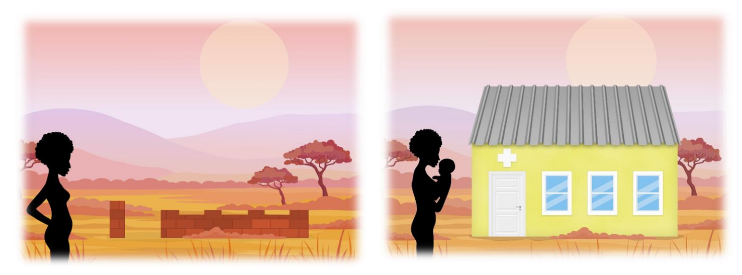
Photo of animation on the website. A visualization of the project progress.

In the newsletter of May, we mentioned that 'Phase 4', vthe construction of the maternity ward, was delayed several months due to unprecedented persistent rainfall affecting all of East Africa. The roads and water pipes were destroyed and now repaired. Because trucks constantly got stuck in the mud, we paid higher transport costs. The major infrastructure works were therefore stopped and only the incinerator (small incinerator) was completed. The old, dangerous, "waste-pit" near primary school, a hole in the ground fenced with acacia branches where all medical waste was burned, is now a thing of the past.